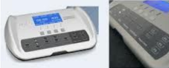
e-Pro 12' Advanced Digital Control Box with Soft Keys

Simple to use soft-touch buttons for manual control and a guidance chart with recommended settings. Sturdy system with hundreds of settings!