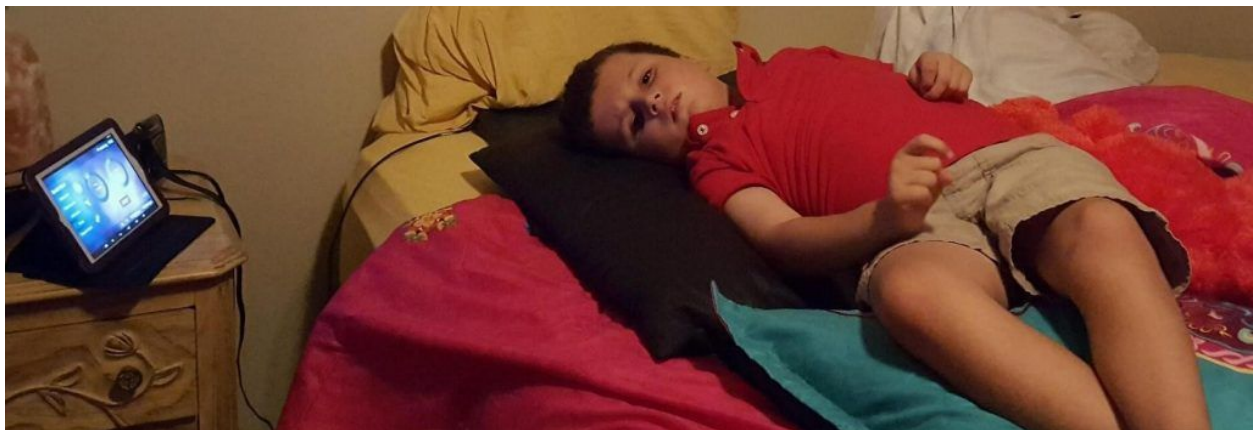
Child using the e-Earth Energy Wellness System

In Eileen’s practice, she has found the e-Earth Energy system useful in supporting underdeveloped neurological systems , people with autoimmune conditions , and people with both chronic and acute illnesses . All the members of her family have used the system with great benefit, including one on the autism spectrum. It was Eileen’s desire for recovery that prompted her to explore e-Earth Energy’s benefits for people on the spectrum and inspired her to conduct a study on its effects on four children ages 8 to 13 with autism spectrum disorder (ASD), three of whom were nonverbal at the study’s start.